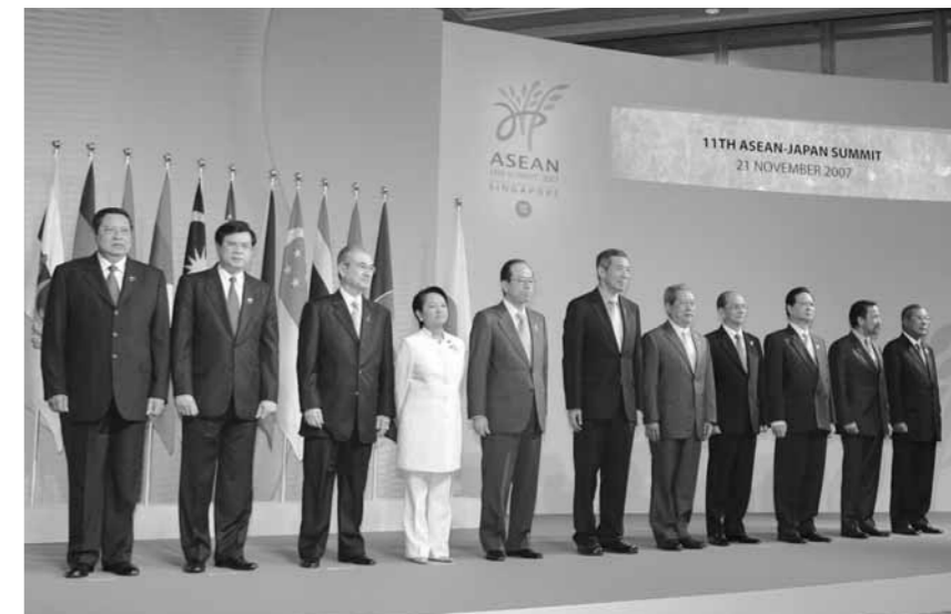
The Eleventh ASEAN-Japan Summit (Singapore, November 2007)